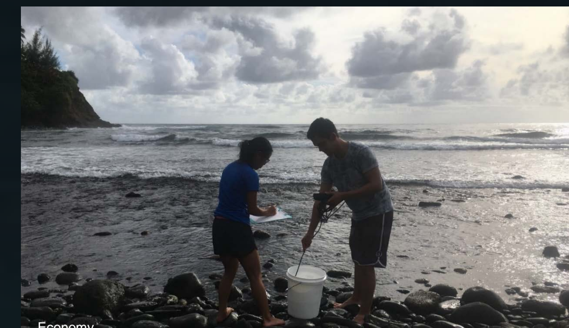
Climate driven shifts in Staphylococcus aureus and MRSA in near shore waters.