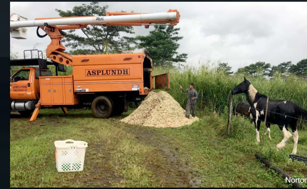
Mulching non-native albizia to support climate change mitigation and sustainable agricultural practices.