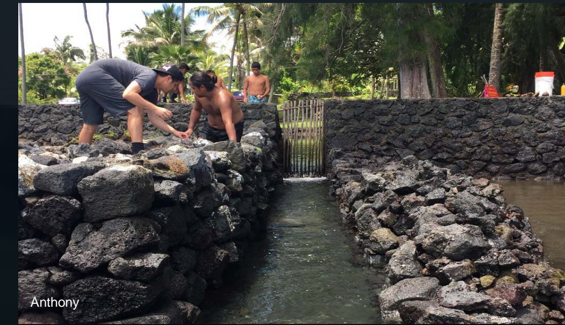
Impacts of climate change and ground water shifts on loko i'a management (traditional Hawaiian fishponds).