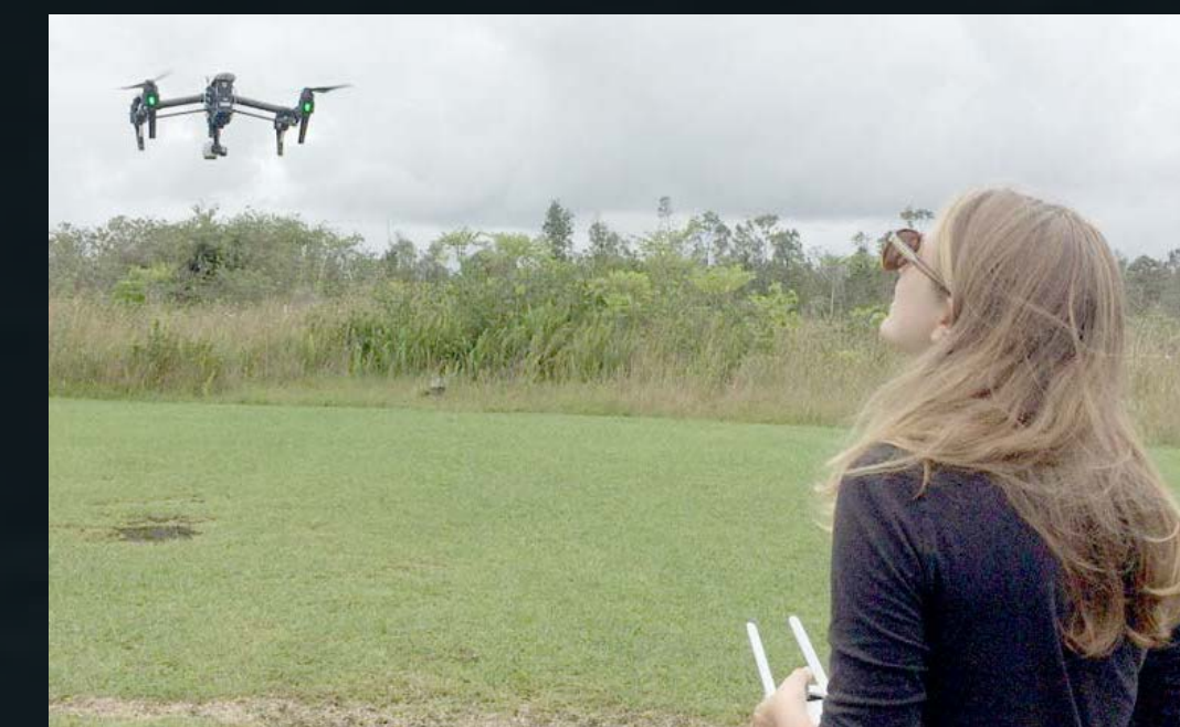
Estimating coastal erosion rates on Hawai'i Island in relation to SLR to inform coastal development setbacks.